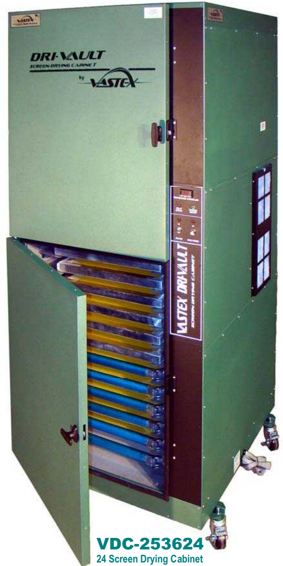
VDC-253624 24 Screen Drying Cabinet

Dry your screens securely in the 10 or 24 screen Dri-Vault. Variable heat and powerful filtered air flow can have your screens ready for exposure, in as little as 20 MINUTES!