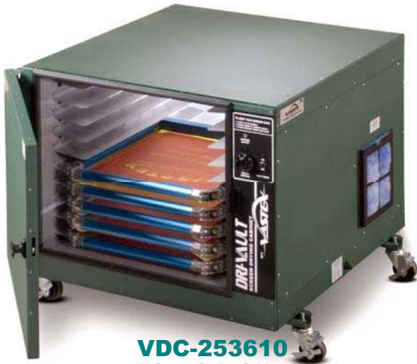
VDC-253610 10 Screen Drying Cabinet